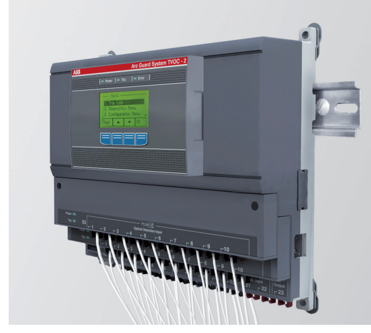
TVOC-2 mounted on DIN-rail