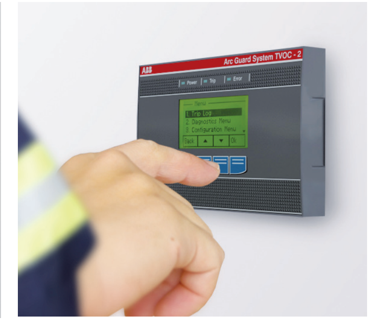
Human Machine Interface

To fit your application, we have added functionality to trip up to 3 breakers. If required, various selectivity can be applied depending on which sensor has triggered.