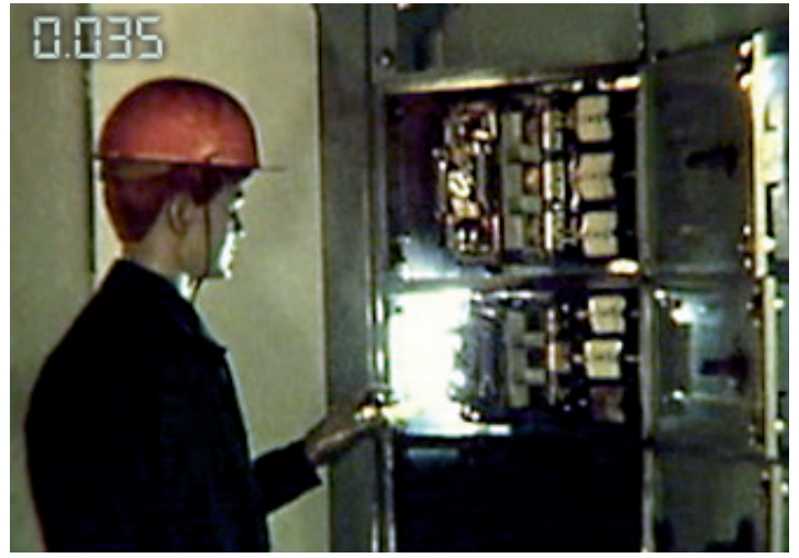
With ArcGuard System™