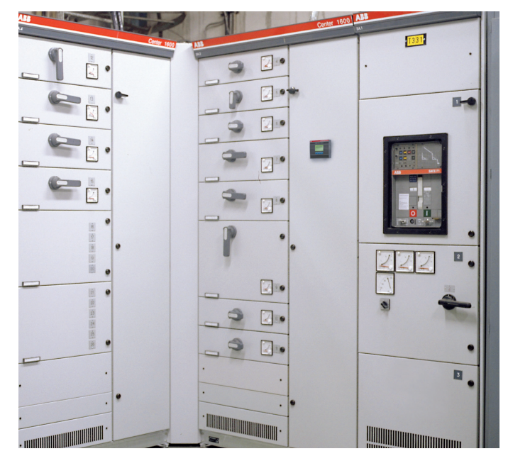
Arc Guard System<sup>™</sup> - TVOC-2 installed in an ABB Low Voltage Switchgear

Using TVOC-2 means that you can meet the highest safety requirements! For example, NFPA70E, a US standard for the safe installation of electrical wiring and equipment, states: "a flash hazard analysis shall be done in order to protect personnel from the possibility of being injured by an arc flash. The analysis shall determine the Flash Protection Boundary and the personal protective equipment that people within the Flash Protection Boundary shall use." With Arc Guard System<sup>™</sup>, these calculations will show that the energy from an arc flash is decreased to an extent that reduces the need for additional protection. Note that the requirements for functional safety ensure the reliability of the figures used in these analyses.